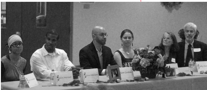
The Women's Forum discussion panel shares stories of love and courage

Nearly 100 people gathered to honor the memory of the founding Executive Director of the InterReligious Council, (now InterFaith Works) at the 6th Annual Dorothy F. Rose Women's Forum on September 28th. The Forum, hosted by Holy Cross Church in Dewitt, was entitled, "Challenges, Triumphs and Strategies of InterFaith /InterCultural Marriage." The panel discussion featured three couples of diverse backgrounds who shared their personal stories of love and courage.