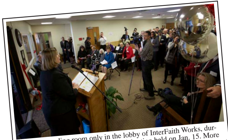
There is standing room only in the lobby of InterFaith Works, during the agency's Grand Opening Celebration held on Jan. 15. More guests were able to watch a broadcast of the ceremony in the adjacent Room of Common Ground, which was funded through a gift of the Allyn Foundation.

Beloved community is a global vision in which all people share in the wealth of the earth, and racism, discrimination, bigotry and prejudice are replaced by an all-inclusive spirit of sisterhood and brotherhood. In beloved community , conflicts are resolved peacefully and adversaries are reconciled through a mutual, determined commitment to nonviolence. Through its mission, vision and programs, InterFaith Works of Central New York aspires to continue to be one of the driving forces for the creation of beloved community in Central New York and to serve as an inspiration to other communities who wish to do the same.