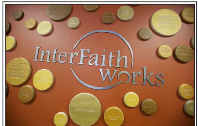
Major donors to the Building Community/Affirming Dignity Capital Campaign are recognized on a donor wall displayed prominently in InterFaith Works' Welcome Lobby. For more information about the campaign, please see "We Invite You to Join" on page 1.