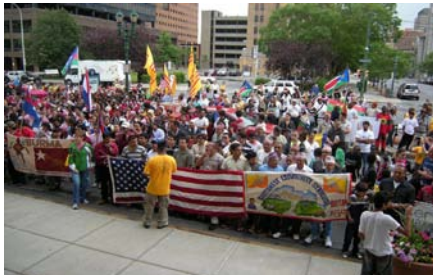
2011 World Refugee Day parade concluded on the steps of Syracuse City Hall

Refugees, asylum seekers, stateless people, internally displaced people...every year on June 20th the United Nations and the world recognize these people, who number in the tens of millions, on World Refugee Day. Syracuse will observe the event on Saturday, June 23rd with a recognition of the tragic plight of millions of families worldwide, and a celebration of the diverse communities we welcome as neighbors in Central New York.